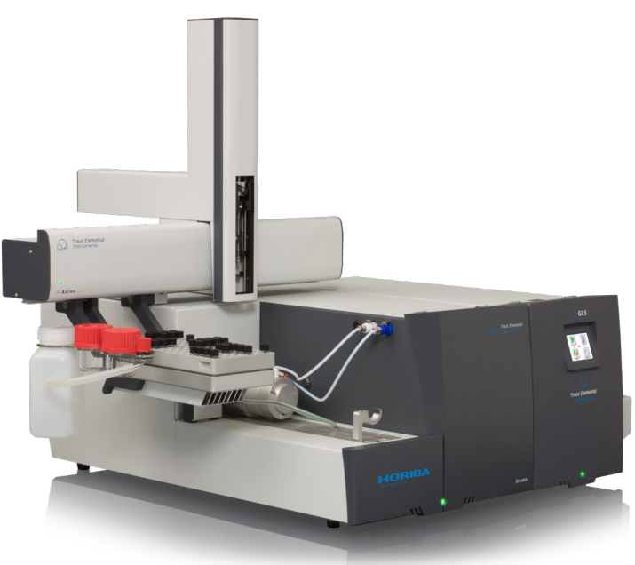
Configuration: XPLORER with GLS*

The XPLORER-TX/TS combustion analyzer handles solid, liquid, gas and LPG samples. Changing from a liquids & gas module to the solids module has never been easier. With the push of one button, the liquids module retracts automatically from the heated zone. No clamps or manual locking. In under one minute, the system can be changed from the liquids mode to the solid mode. Simply choose the pre-loaded sample method and run.