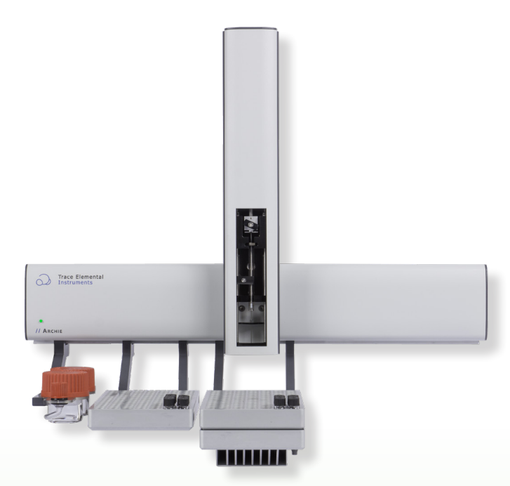
ARCHIE with temperature controlled sample tray

The XPLORER-TX/TS was designed to offer standardized and customized solutions to match both current and future analytical needs.