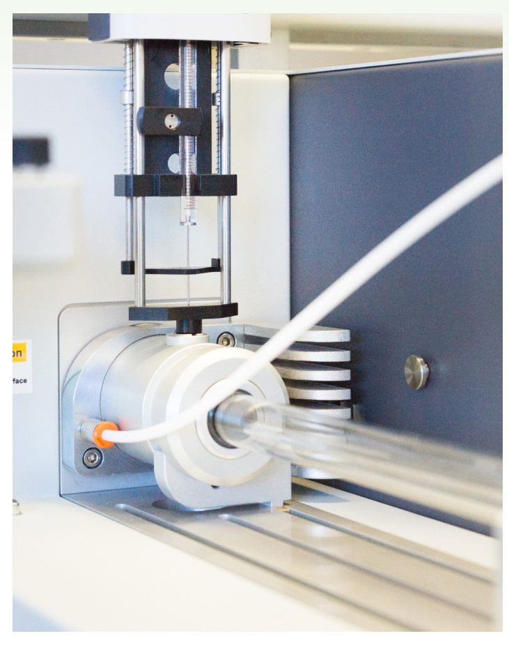
Configuration: XPLORER with ARCHIE*

Coulometric determination of chlorine and sulfur is an absolute technique using the Faraday constant, so no calibration is required. The accuracy is automatically verified using a control standard. The analysis of hydrocarbons at ultra-low concentrations using these new, next-generation coulometers offers unprecedented precision.